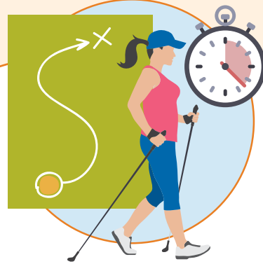
Break down an activity into its parts