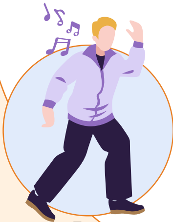
Try something new